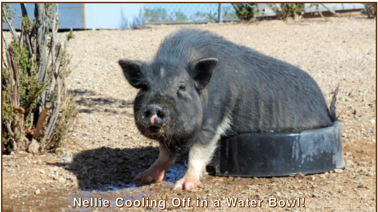
Nellie Cooling Off in a Water Bowl!