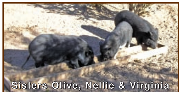
Sisters Olive, Nellie & Virginia

October of 2011. They were living in a horrible tiny pen, males and females together. They were seen advertised on Craig's List and one boar was already sold. We purchased them to keep four more pigs from entering the community and producing many more. The man had purchased two baby pigs for his three-year-old daughter who had no interest in them. They kept having babies so he wanted to be "rid" of all of them. Really? They are all young and Virginia was already very lame. Nellie and her sisters live in a field along with Pop Tart. They are all doing very well and Virginia has really improved. Mario is in another field with his young friend Oliver.