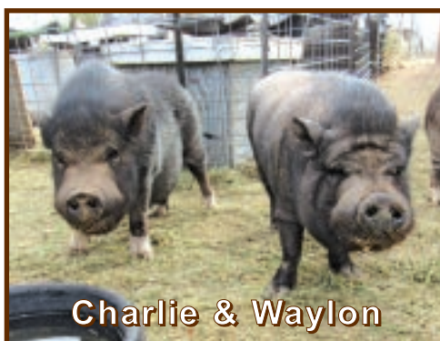
Charlie & Waylon

short trip over to their new home. There are wooden shelters like the ones they had always had in their old field but also two camper