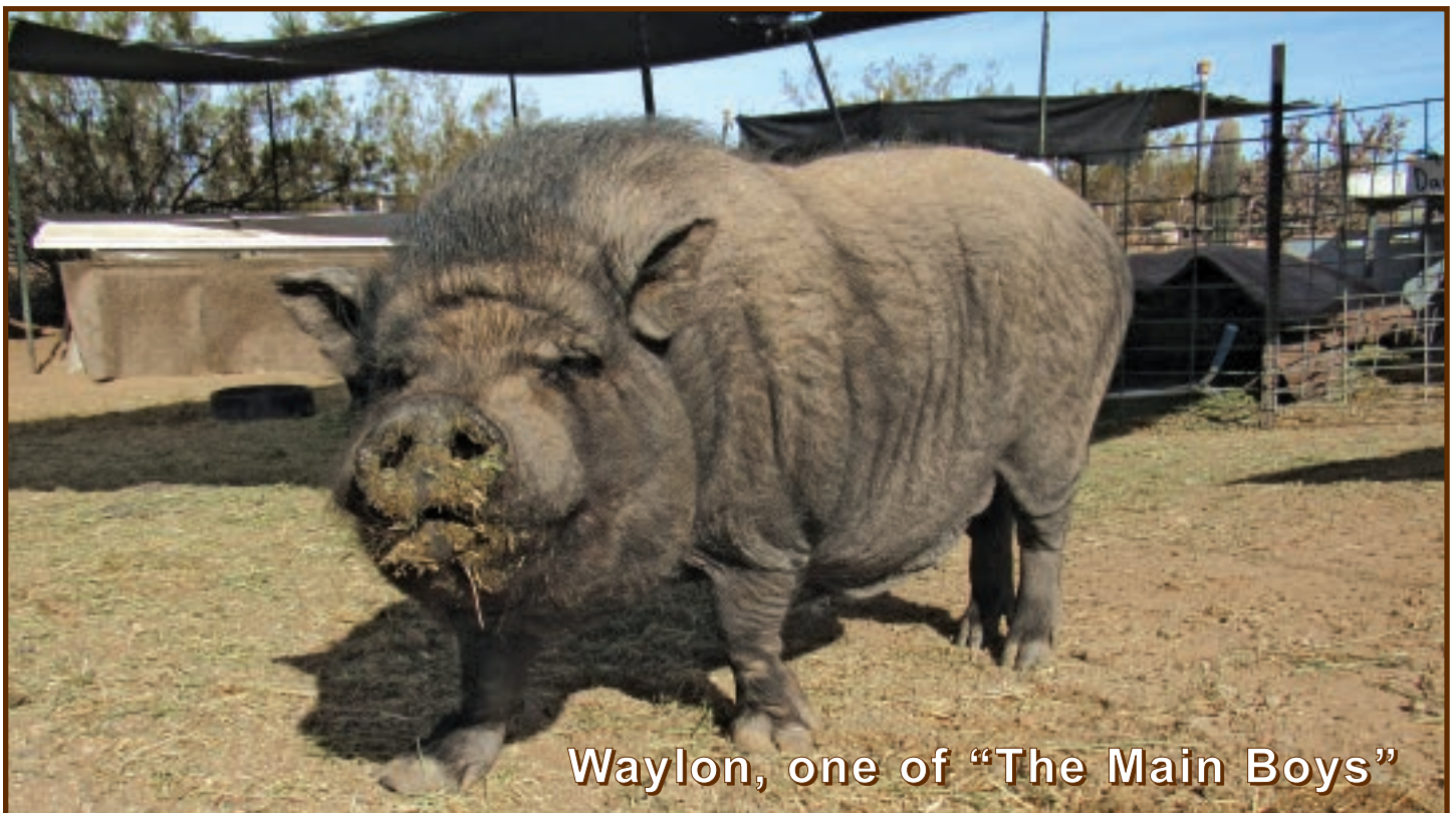
Waylon, one of "The Main Boys"