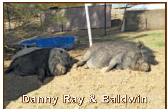
Danny Ray & Baldwin

Last month the five boys were put into individual carriers then loaded into the wagon on the ATV to make the