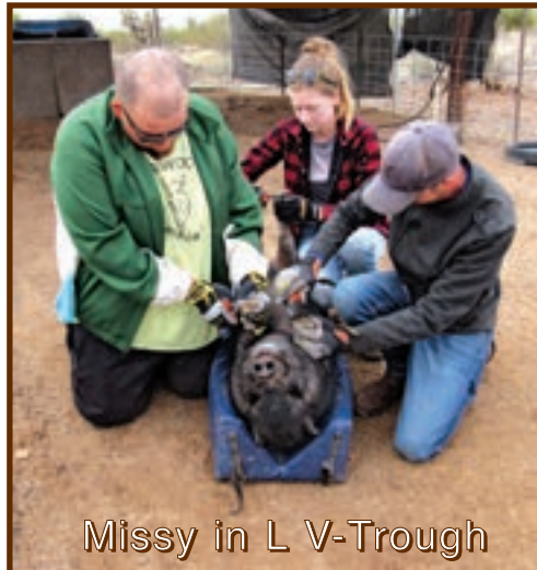
Missy in L V-Trough

and/or tusks and will alert me to add them to the list. Then we also have the "Frequent Flier" list of pigs that are on odd schedules for