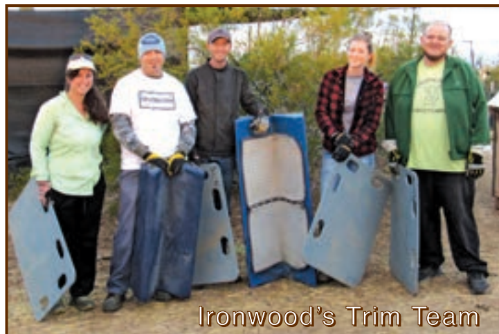
Ironwood's Trim Team

The pigs are really quick to forgive and forget once they are on all fours again. Most will just meander off like nothing ever happened.