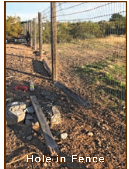
Hole in Fence

with the owner of this 'rescue' in an attempt to try and educate her on what changes needed to be made to help these animals. We discussed in detail the basic care the pigs needed and when I learned she couldn't afford a $15 bale of hay, it put everything into perspective. I was quite certain nothing else would ever be done to better the lives of the animals in her care. Sadly, with the current laws in place and lack of an animal control agency in that