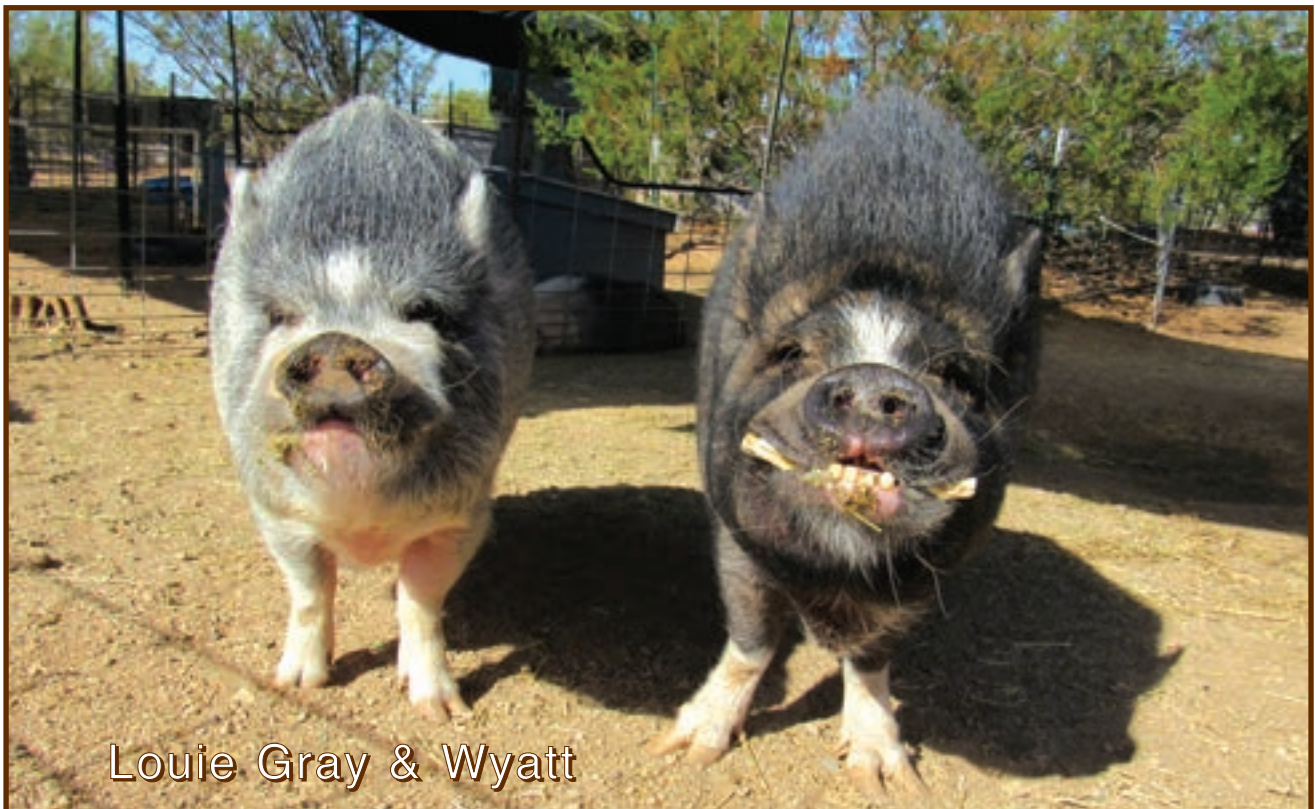
Louie Gray & Wyatt