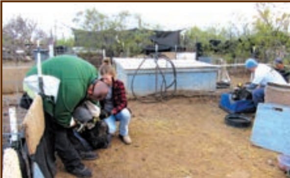
Trimming Bonnie &amp; Mr. Piggles