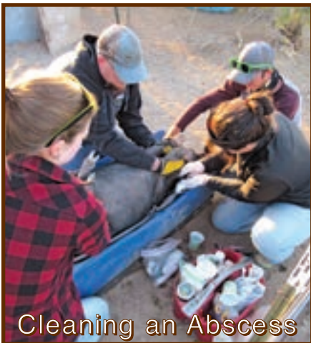
Cleaning an Abscess

Usually it takes 2 people to do this. One will pull the pig's lips back away from the tusk so they won't get cut by the wire. The other person uses a gingly wire attached to handles to saw through the tusk. There is no nerve in the tusk so the pig does not feel any pain. The wire heats up so it's important for the two people to communicate and be well aware of what the other is doing. Occasionally a third person is needed to hold the front legs still if the pig is struggling or