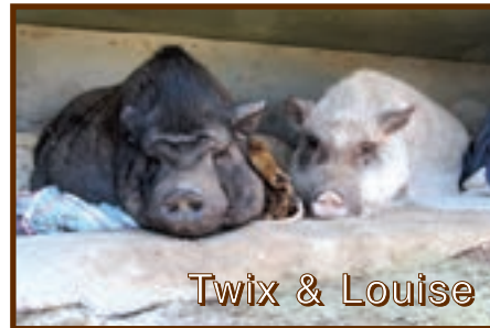
Twix & Louise

over heels in love with Louise who seldom comes out of their house. He found a way to sun himself while still being able to gaze adoringly at his dear Louise.