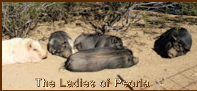
The Ladies of Peoria

moist ground afterward is always fun. The piggies love to root and dig, making large indentations that are just perfect for their body size...an